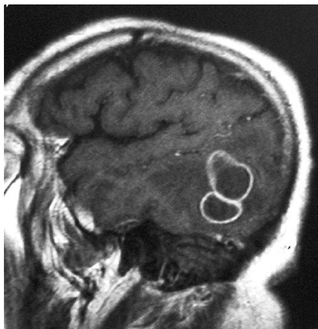
FIG. 2. Cranial sagittal T1-weighted magnetic resonance image showing an abscess formation in the left temporo-occipital region.

with its capsule (Fig. 3). Using the same isolation methods as those mentioned above (including the smears), the Nocardia asteroides complex was again identified in cultures of the drainage specimen obtained from the cerebral abscess excised on 26 July 2004. After the surgery, the patient recovered progressively. At the fourth month after the surgery, medical therapy with TMP/SMX continued with a dose of 10 mg/kg trimethoprim per day, and the patient had no complaints. Lab-